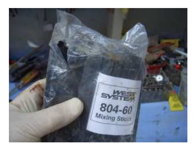
...also a mixing stick.